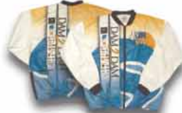
Dam to Dam- 4 color