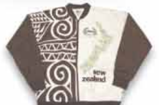
New Zealand- 2 color