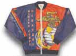
USMC Marathon- 3 color