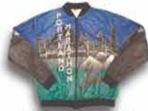
Portland Marathon- 2 color