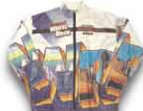
Dallas White Rock- 4 Color