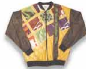
Houston Marathon- 4 color