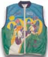
Seattle to Portland- 4 Color