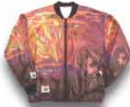
Nintendo Zelda- 4 color