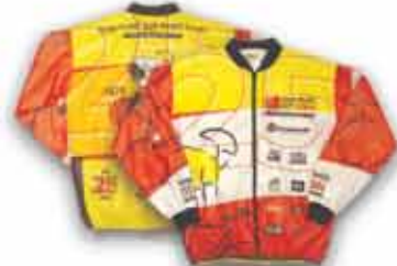
Seattle to Portland 2004- 4 color