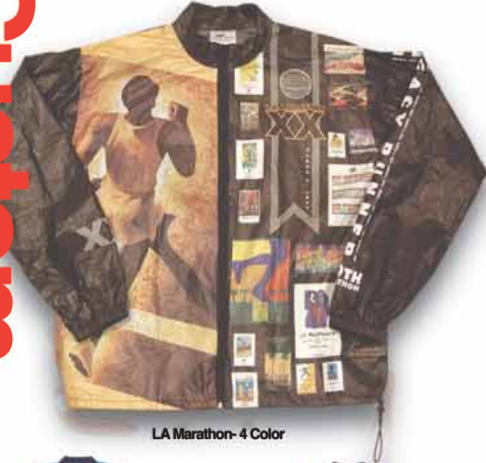
LA Marathon- 4 Color