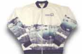
Big Sur Monterey- 2 Color