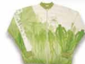
Sweet Corn Challenge- 1 color