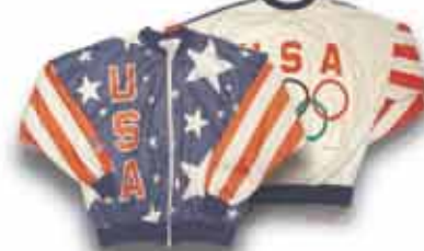
General Mills- 2 color