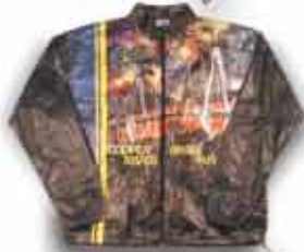
Cooper River- 4 Color