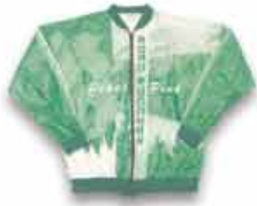
Pikes Peak Marathon- 1 color