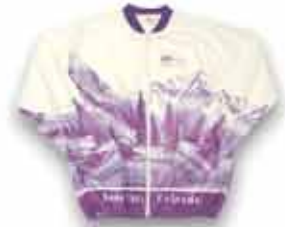
Pikes Peak Marathon- 1 color