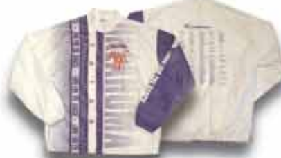
Tulsa Oklahoma Marathon- 2 color