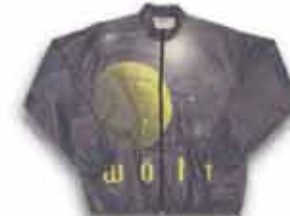
World of Team Tennis - 2 color