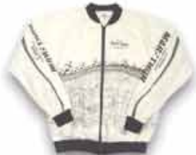
Long Island Marathon- 1 color