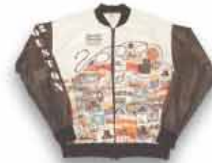
Houston Marathon-4 color