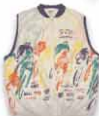
Seattle to Portland- 4 Color