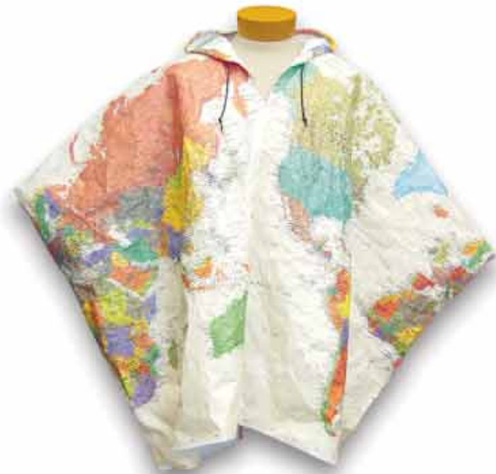
World Map Poncho- 4 color process

Experience a Tyvek® Jacket, Vest, or Rain Poncho and learn why our customers have requested Tyvek® over and over for the past 20 years.