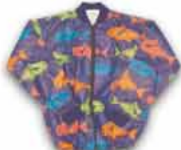
Bob Chin- 4 Color