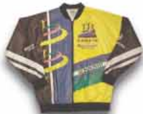
Carifta Games- 4 Color