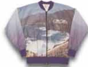
Big Sur Marathon- 4 color