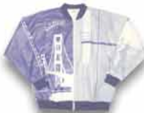
San Francisco Marathon- 1 color