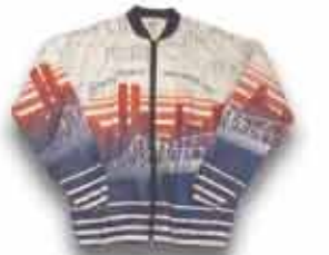
Race for the Cure Peoria- 2 color