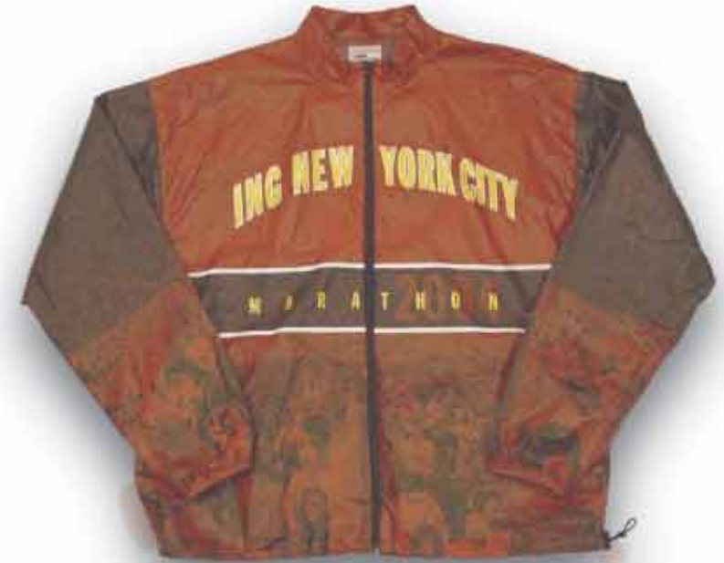
ING NY City Marathon- 3 Color