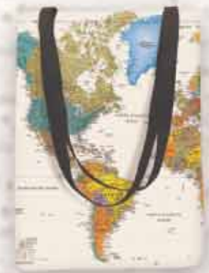
World Map Envelope Tote 18" h x 13" w (Europe/Africa shows on opposite side)