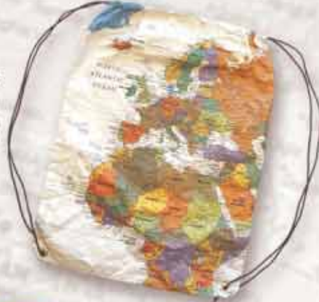
World Map Backpack 18" h x 13" w (Other dimensions available in larger quantities)