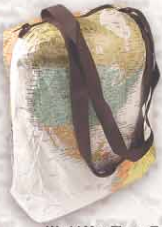
World Map Zipper Tote 18" h x 13" w (North America / Europe shows on opposite side)