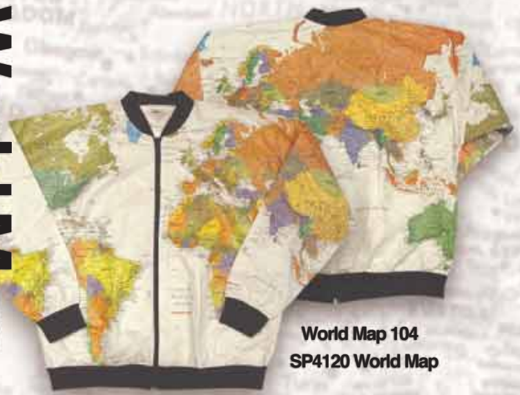
World Map 104 SP4120 World Map