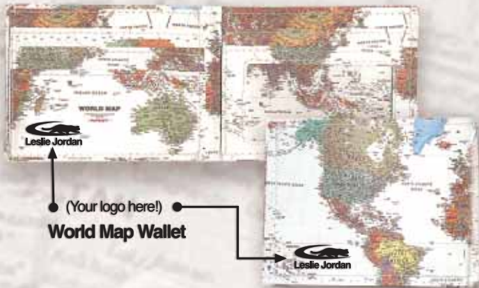
(Your logo here!) World Map Wallet